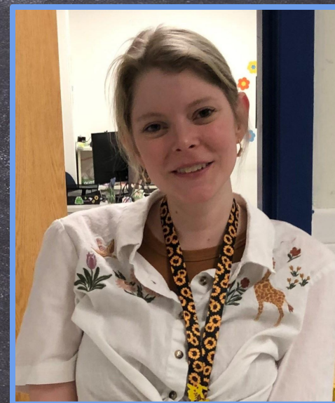
Susan Waring Kindergarten Grades 2, 4, 6