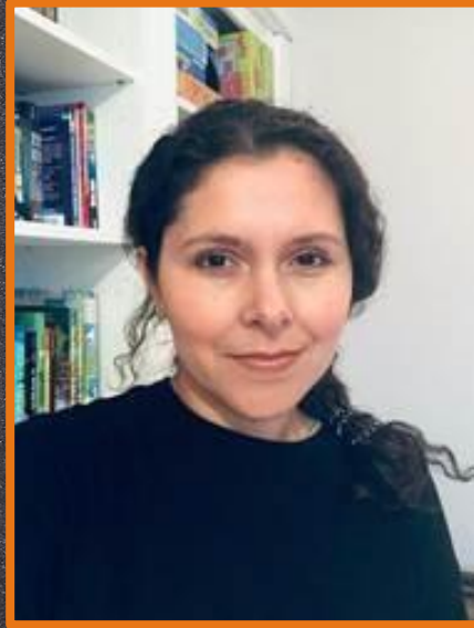
Laurel Ridge Family Liaison